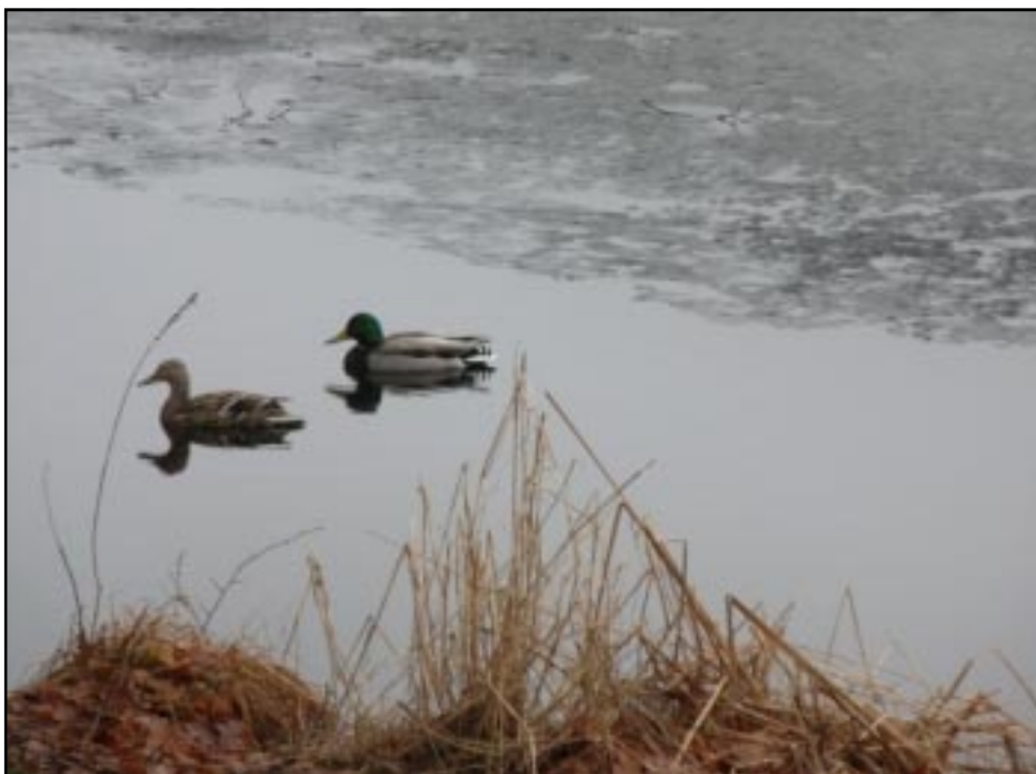
Ice Retreats in Echo Cove

Finally, the ice melts and it is spring at last on Chebacco Lake! Please send in your wildlife sightings to: dcksjl@comcast.net