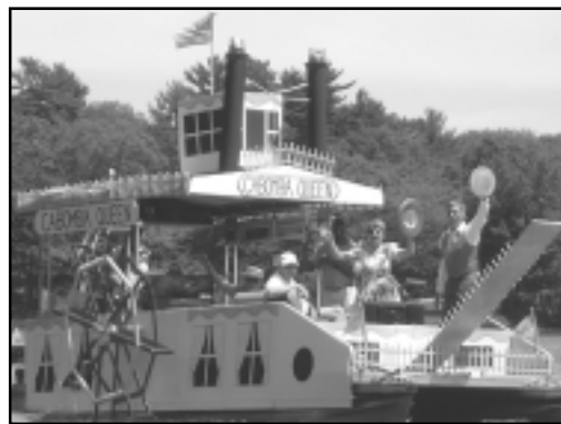
The Cabomba Queen in the 4th of July Boat Parade