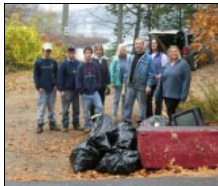
Fall clean up crew, 2005

Lastly, to answer the question above "what did we NOT find at and around the boat ramp?" the answer is "everything but the kitchen sink!"