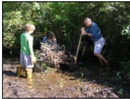
Everyone pitches in to clear the way.