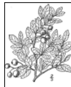
Vaccinium (Lowbush Blueberry)