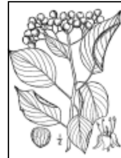
Cornus alternifolia (Pagoda Dogwood)