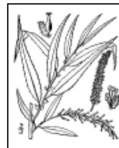
Salix nigra (Black Willow)